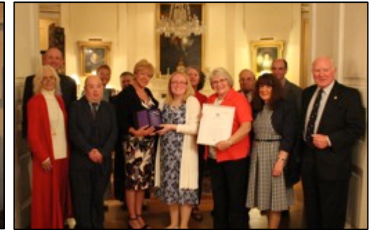
SMHC President, committee members, volunteers and supporters receive the Queen's Award at Birdsall House near Norton