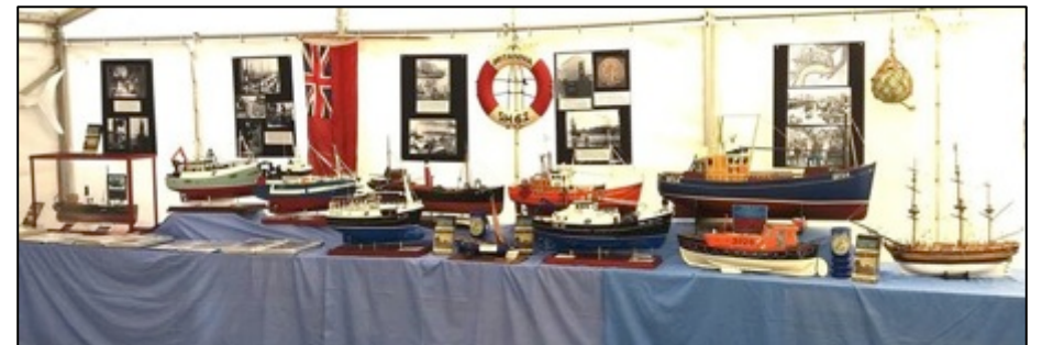
This year's Seafest was a great success with an estimated 15,000 visitors attending. Thanks go to all our volunteers who staffed it.