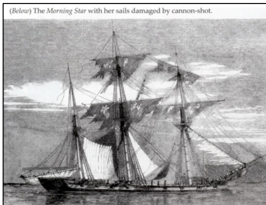
(Below) The Morning Star with her sails damaged by cannon-shot.