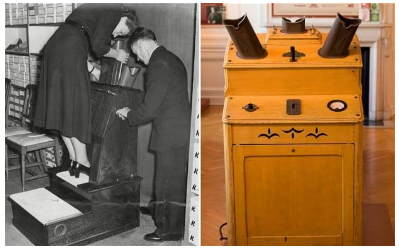
The X-Ray machine known as a fluoroscope used to measure shoe sizes.