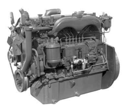
Perkins P6 Diesel

But certainly from shortly after Arthur Edmondson took over, Miss Velocity used Perkins diesel engines<sup>18</sup>. The first engine fitted by Arthur after he took over was almost certainly a Perkins P6. This was a 6 cylinder engine of 5 Litres capacity giving 86 BHP at 2600 RPM. This engine was first produced for trucks in the lead up to the 2<sup>nd</sup> world war. At that time it was extremely powerful for its size and weight. It proved very successful for Perkins. A marine version was produced for the military market during the war and sales began to the civilian market afterwards. The transmission was hydraulic incorporating forward and reverse gears.