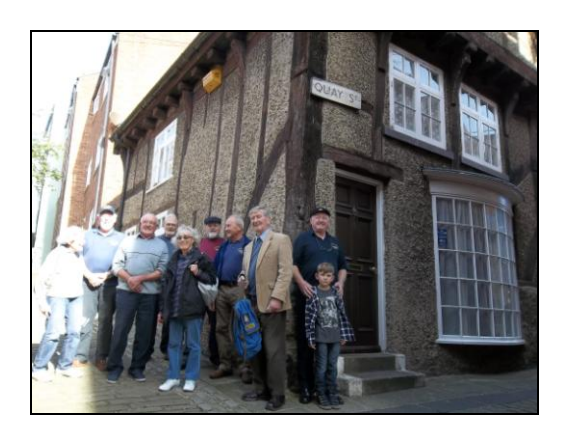
Coble & Keel Boat Society Visit

Thanks also go to all those who donated maritime photographs, charts, certificates, books & artefacts in the past few months.