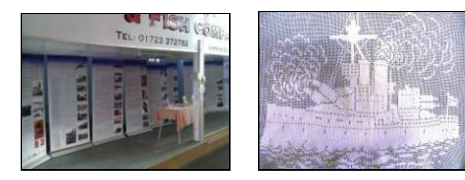
Photo above left - Our 'Scarborough in world war two' exhibition is on display in the empty fish shop area of the Market Hall.

VIOLA—The Life and Times of a Hull Steam Trawler is an engrossing read. Some 800 trawlers and their crews were engaged in the most dangerous civilian occupation in WW1. They were requisitioned from the Hull and Grimsby fleets to hunt U-boats and sweep for mines. One quarter of those vessels were lost, along with half their crew. Viola was one of this fleet and was built in Beverley. She survived the war and was sold into whaling, sealing, and exploration in the far South Atlantic. Today she lies rusting at the derelict whaling station of Grytviken in South Georgia. Available from Lodestar books (internet) £12.