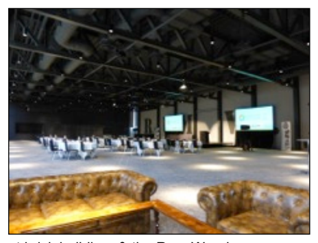
The old Tobacco warehouse, once Europe's largest brick building, & the Rum Warehouse venue