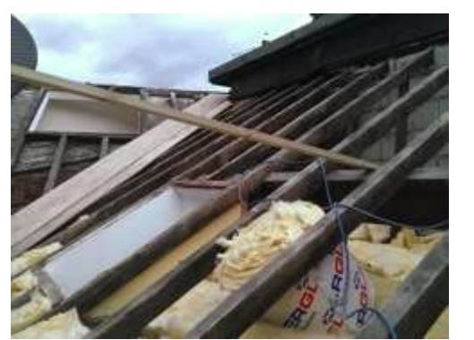
Scaffolding goes up

Old roof comes off and insulation goes in