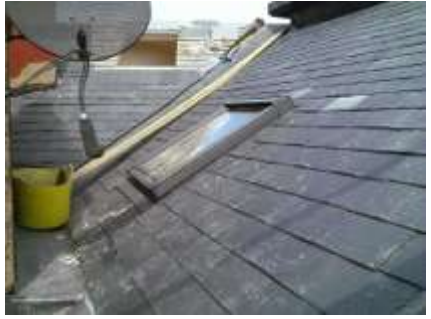
New roof in place

Old roof comes off and insulation goes in