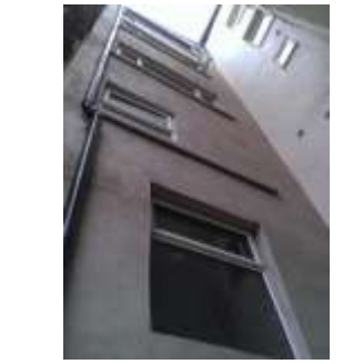
Back rendered & new windows

The property consists of a two bedroom flat above a shop with basement and cellar for storage below. The electrician has re-wired the flat and installed a fire alarm system ready for renting and paying back the 'Charity Bank' loan.